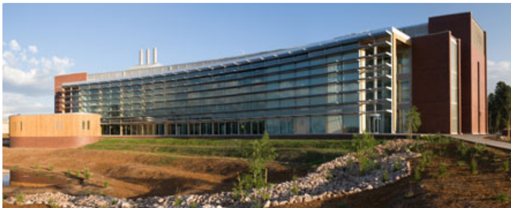
The Applied Research and Development Building was one of 15 buildings world-wide to receive a 2009 recognition award from the Royal Institute of British Architects.