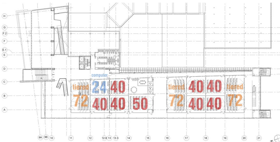
Classrooms as part of the upcoming Health and Learning Center