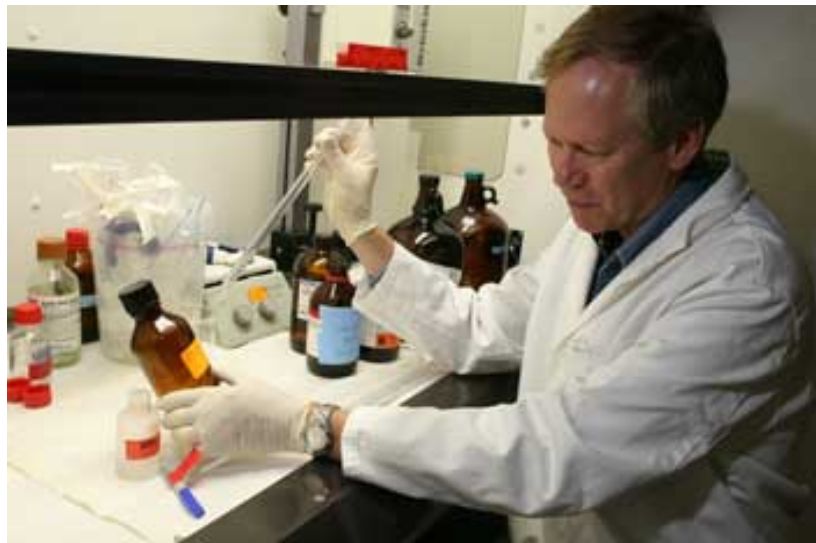
The Keim Lab in the Applied Research and Development Building