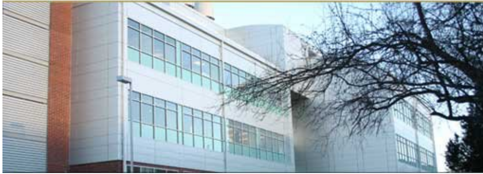
New Lab Building – equipment enhanced