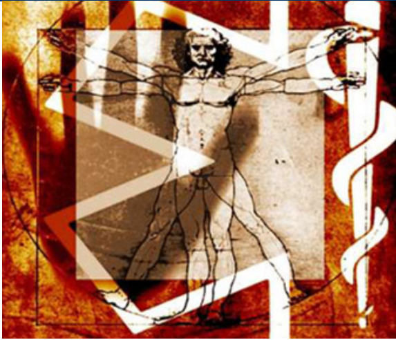
The Interdisciplinary Health Policy Institute

Interdisciplinary Health Policy Institute